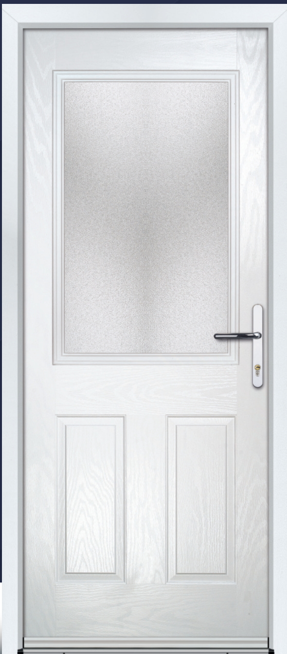
Eaton EX8 Available with Clear or Stippolyte glass only.

While the front door sets the tone for your curb appeal, the rear door adds the finishing touch to your home's character. Elevate both entrances, ensuring a harmonious blend of style and security.