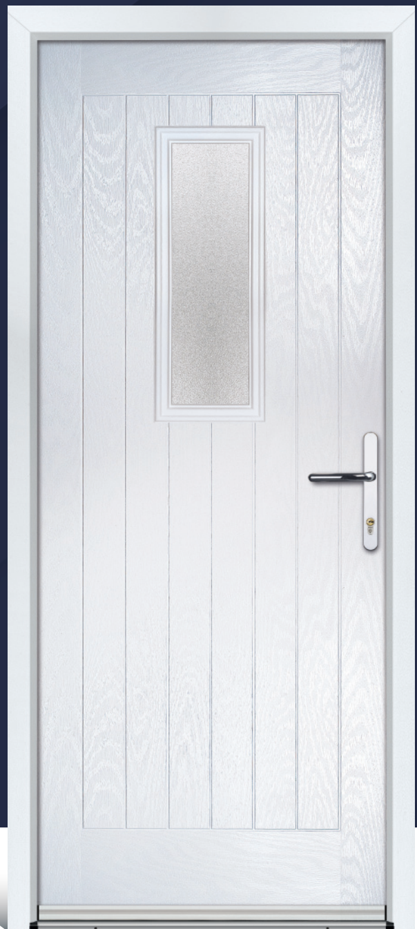
Goswell EX17 Available with Clear or Stippolyte glass only.